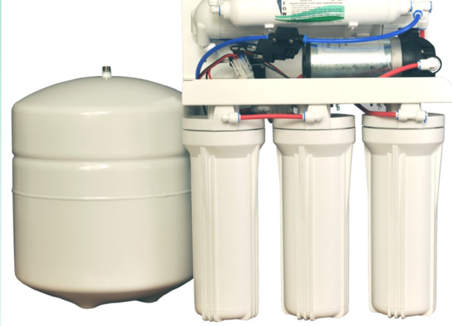
Booster Pump Model Shown Above