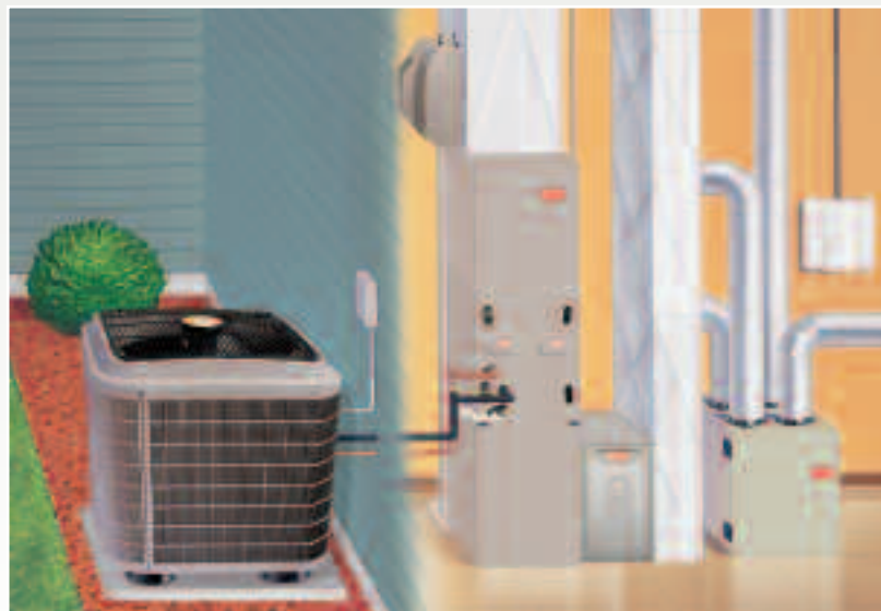
Heat Pump and Fan Coil System