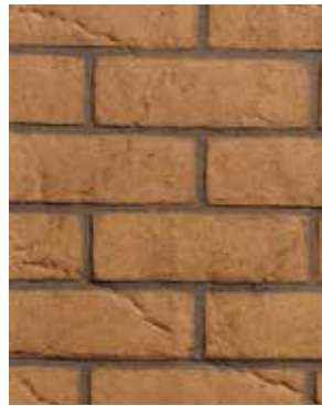
Buff Stacked Liner