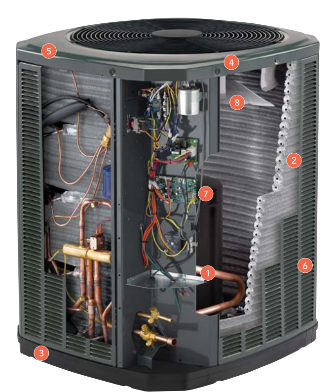
*XR17 shown for illustration purposes.