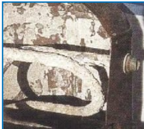
Inside of Boiler with limescale build-up