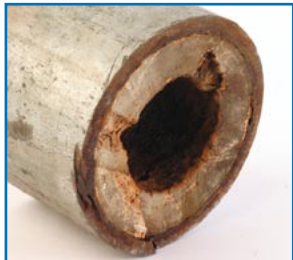
Cutaway of pipe with limescale build-up