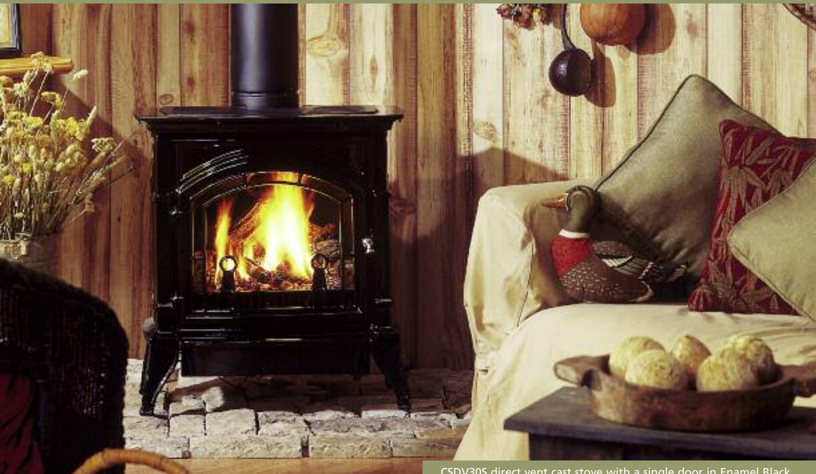
CSDV30S direct vent cast stove with a single door in Enamel Black