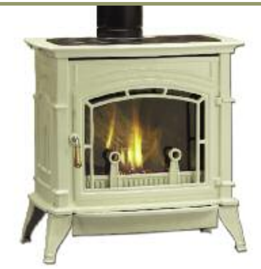
CSDV40S direct vent cast iron stove with a single door in Enamel Sand