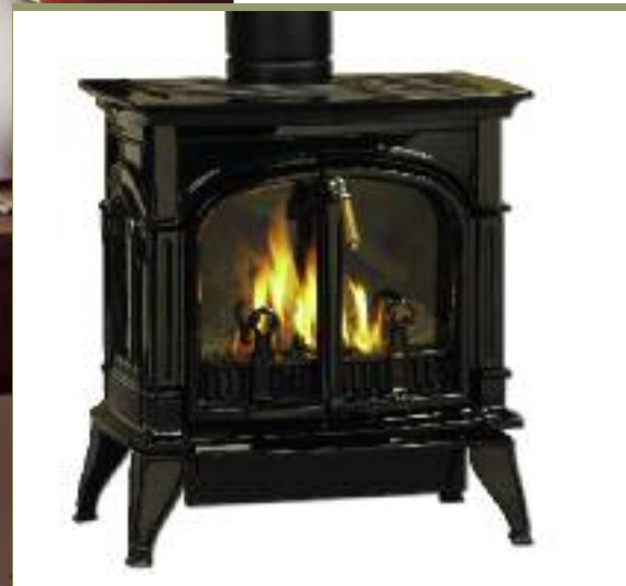
CSDV30D direct vent cast iron stove with double doors in Enamel Black