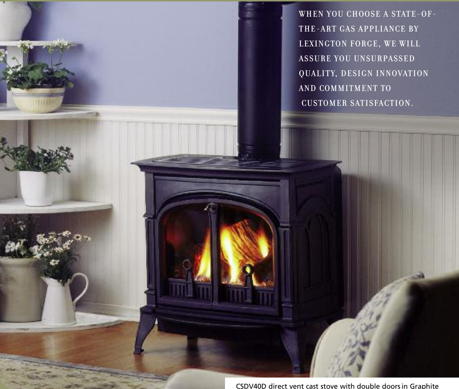
CSDV40D direct vent cast stove with double doors in Graphite

WHEN YOU CHOOSE A STATE-OF-THE-ART GAS APPLIANCE BY LEXINGTON FORGE, WE WILL ASSURE YOU UNSURPASSED QUALITY, DESIGN INNOVATION AND COMMITMENT TO CUSTOMER SATISFACTION.