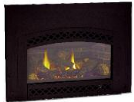
A142DV direct vent inserts