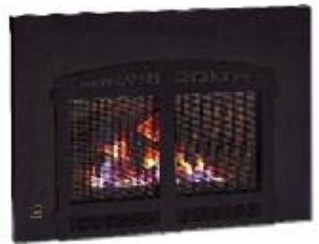
A131DVC direct vent inserts

A131DVC direct vent fireplace insert shown with Gold Tone fire screen doors and Black surround