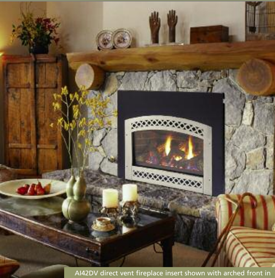
A142DV direct vent fireplace insert shown with arched front in Brushed Pewter and Black surround