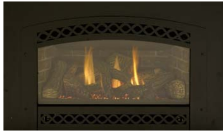
Decorative Arched Front (Black)