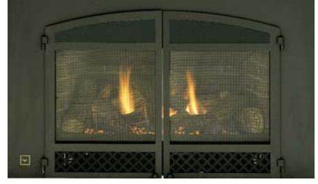
Fire Screen Doors (Black)