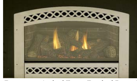
Decorative Arched Front (Brushed Pewter)