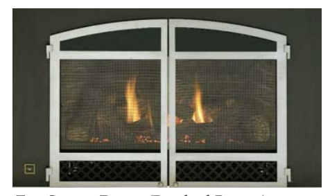
Fire Screen Doors (Brushed Pewter)