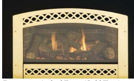
Decorative Arched Front (Gold Tone)