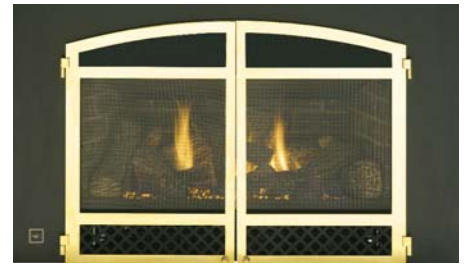
Fire Screen Doors (Gold Tone)