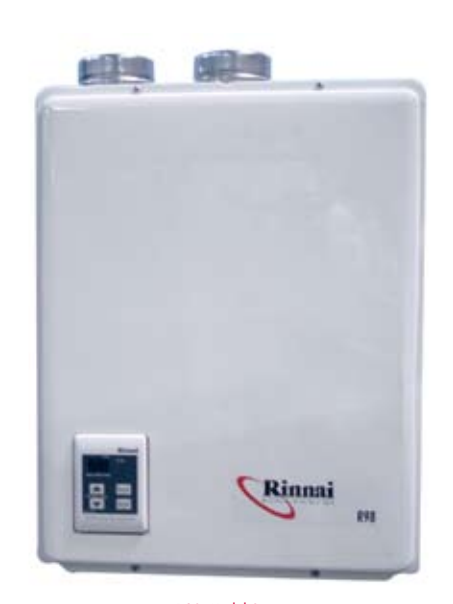
R98i Model Series Shown With Integrated Control