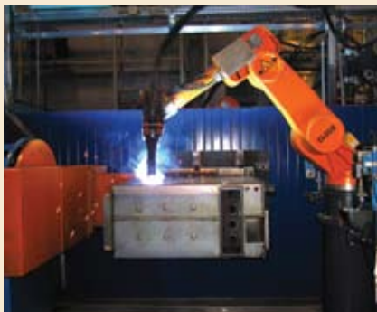
State-of-the-art robotics technology within Fröling's manufacturing plant.