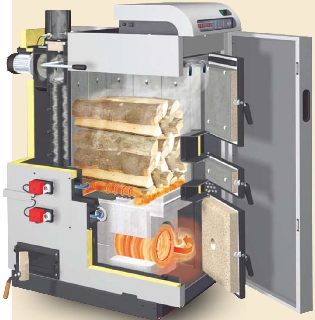
Image used for informational purposes only. Actual appearance may vary.

Kindling, tinder and paper are loaded into the Turbo 3000 followed by standard cord wood. The fire is then lit via the Ignition Port. This small access door is unique in the industry and makes lighting a fire very quick and easy. The wood gasification combustion process begins when the draft induction fan turns on and pulls fresh air into the boiler. This air is pulled into the bottom of the firebox and down through the live charcoal bed. The primary combustion that takes place in the firebox produces a hot mixture of unburned gases that are pulled down into the patented Vortex secondary combustion chamber. Simultaneously, additional pre-heated air is injected into this stream of hot gases resulting in a very hot 1800°F to 2000°F secondary burn. Only at these temperatures can a high efficiency, clean burn be achieved.