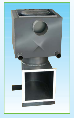
Ultrasonically-tested heavy gauge Primary and Secondary Heat Exchangers

The Regal ECM furnace is manufactured with a durable 10-gauge Primary Heat Exchanger lined with specialty-grade 18SR Stainless Steel and a 14-gauge Secondary Heat Exchanger. Each heat exchanger is then ultrasonically tested to insure the integrity of its welding.