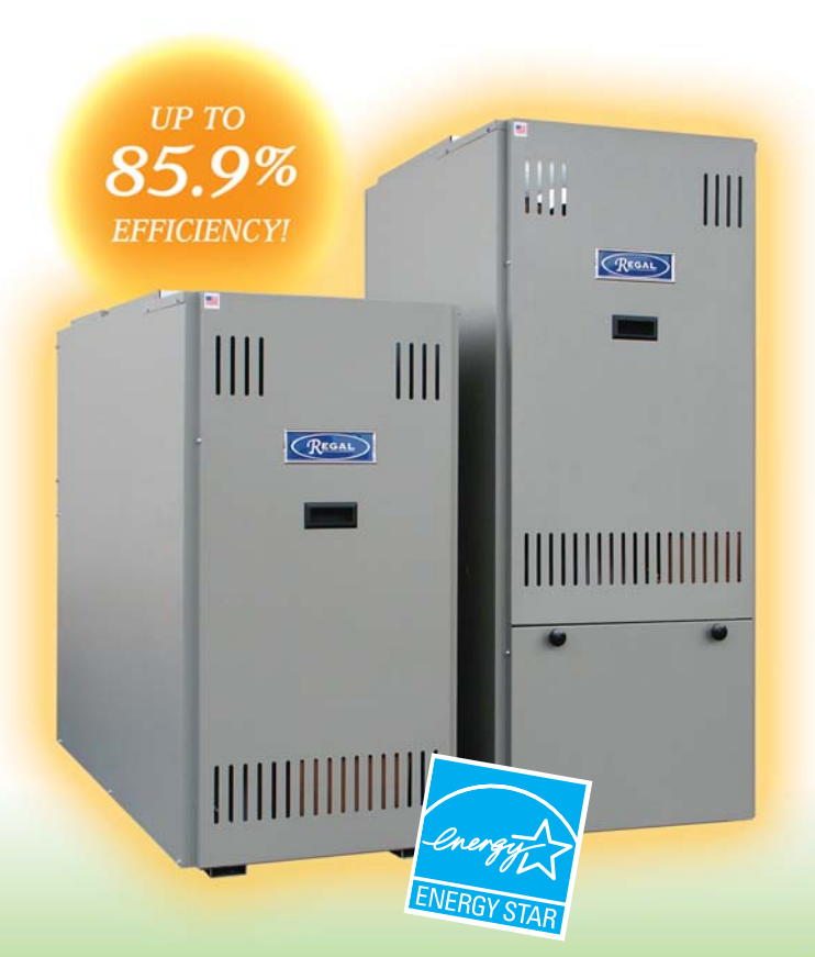
*Energy and fuel rebates are available for Energy Star-rated furnaces. These rebates could save you hundreds of dollars on a Regal purchase!

Do you notice temperature swings in your home? Hot and cold spots? Is your house dry in the winter and humid in the summer? Is your heating and cooling system noisy because its motor is running continuously at full speed? Are you considering 2-stage heating and cooling options? If you answered "yes" to any of these questions, the Regal ECM Hybrid Synergy System is your solution: