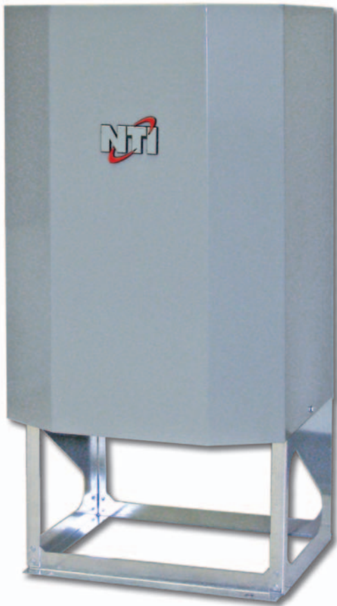
Ti-150 with floor-mounting stand