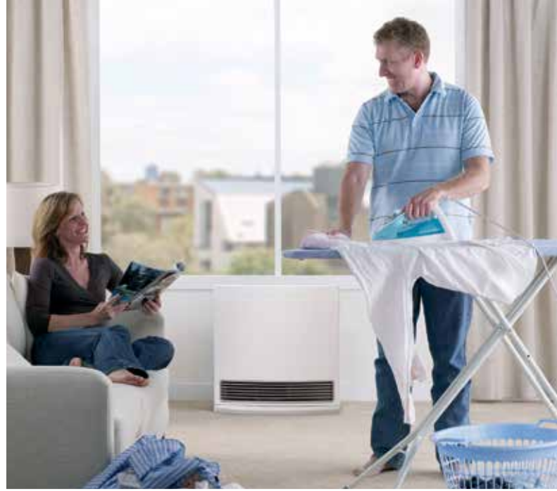
National heat zones