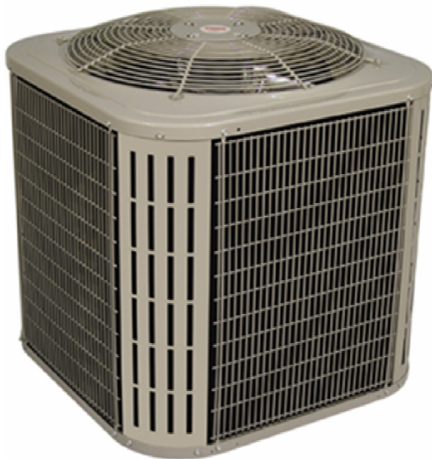
Shown with optional dense coil guard