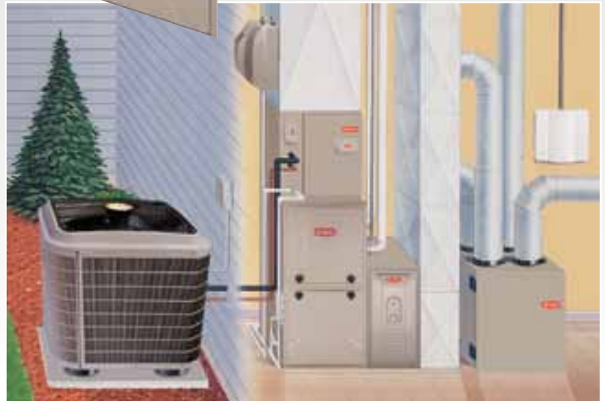
HYBRID HEAT® Deluxe Heat Pump and Deluxe Gas Furnace System