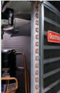
Goodman's SMARTCOIL 5mm tube condensing coil design optimizes the heat transfer ability of R-410A refrigerant compared to standard 3/8" copper tubing.

We know that the last thing you want to hear at night is a noisy heat pump starting up. So, we build our Goodman brand SSZ16 Heat Pumps with sound-dampening features that help ensure that your cooling system doesn't interfere with a good night's sleep. We rely on a quiet condenser fan system – a three-bladed fan, a foam condenser sound blanket and a unique louvered sound-control top – to reduce fan-related noise. Your Goodman brand SSZ16 Heat Pump will keep your home cool and comfortable, year after year.