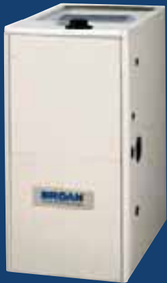
95.1% Downflow Gas Furnaces