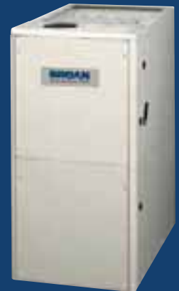
80% Upflow/Horizontal Gas Furnaces