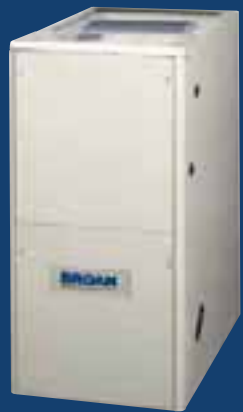
80% Downflow Gas Furnaces