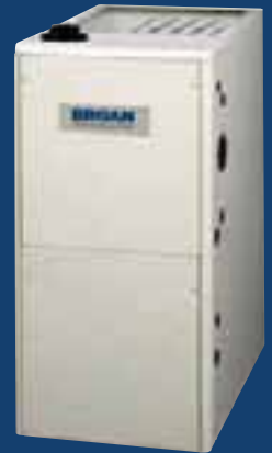
95.1% Upflow/Horizontal Gas Furnaces

to the amount of fuel that you supply to the furnace. Thus, a furnace that has an 80% AFUE rating converts 80% of the fuel that you supply to heat – the other 20% is lost out of the chimney. Compare this to an older furnace that may only deliver 60% efficiency.