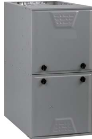
Illustrations and photographs are only representative. Some product models may vary.