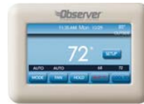
TSTAT0101SC (Sold Separately)

* Applies to original purchaser/homeowner, some limitations may apply. See Warranty certificate for complete details.