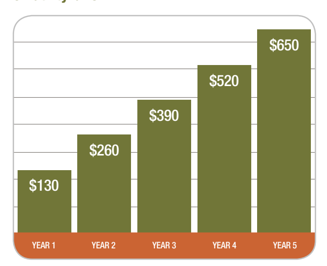
U.S. Average Five-Year Electric Cumulative Energy Savings for High-Efficiency 18 SEER Heat Pumps vs. 10 SEER. Energy Efficiency and renewable Energy Network, U.S. Department of Energy. The U.S. national average is used for electricity consumption. Actual cost savings may vary depending on personal lifestyle, system settings, equipment maintenance, local climate, actual construction, installation of equipment and duct system, hours of operation and local utility rates. This information is intended as an example for comparison purposes only.