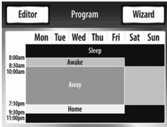
Program summary screen