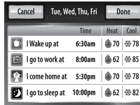
Editor summary screen

Note: Humidity levels are not included as a programmable option, even if a humidifier or dehumidifier is installed and controlled by the Smart Thermostat.