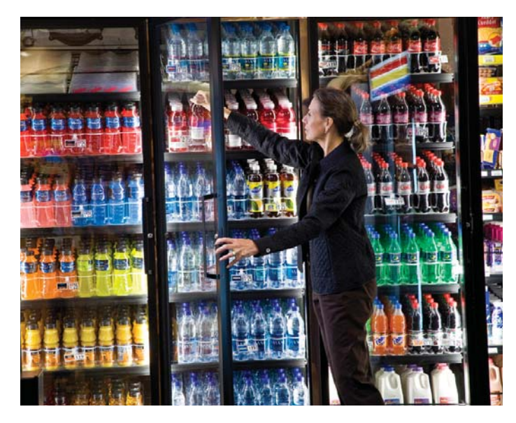
Copeland Scroll ZS*KA delivers best performance for extended medium to high temperature applications.

For more information about Copeland Scroll ZS*KA compressors refer to Application Engineering bulletin AE4-1387 or visit Emerson Climate.com/CopelandScrollZSKA