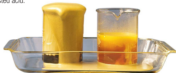
Competitive Product with Dangerous Foam

To demonstrate its capability as a low-foam product, Liquid Scale Dissolver was added to a beaker containing lime scale. A leading competitive hydrochloric acid based product was added to another beaker containing an equal amount of lime scale. The difference is dramatic. When cleaning towers and evap condensers, low-foam is the preferred approach as high foam is both dangerous to personnel and surroundings and it represents wasted acid.