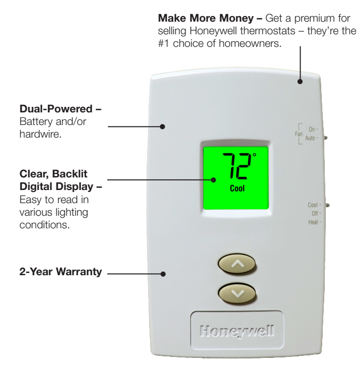
PRO 1000 Non-Programmable