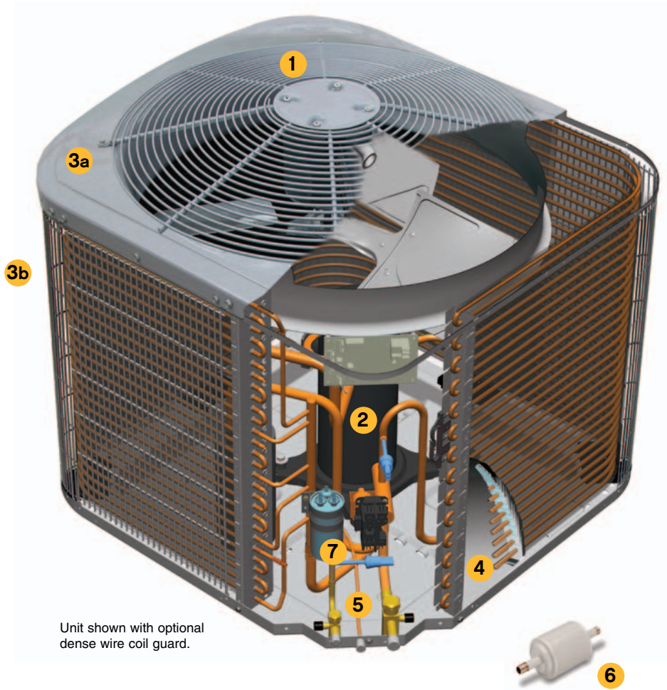
Unit shown with optional dense wire coil guard.