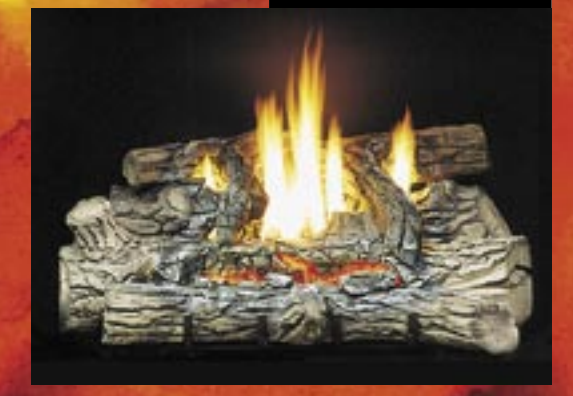
LOGF30 Log Set