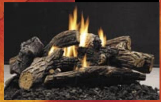
*LOGC31 Log Set