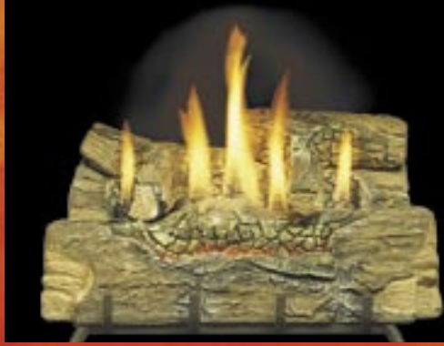
Gas Burner illustrated is a GLMV38MVP