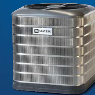
M1200 Plus 13 and 14 SEER Comfort Systems

Manufactured under license by NORDYNE, O'Fallon, MO. ®Registered Trademark™Trademark of Maytag Corporation or its related companies. ©2008 All rights reserved. 233C-0408