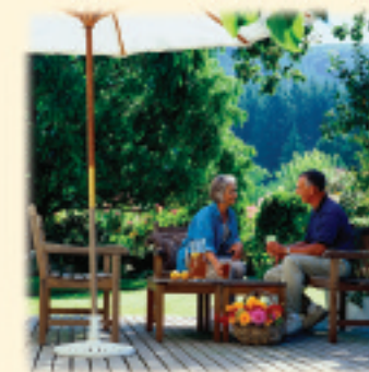
Renovations, Additions and Vacation Homes