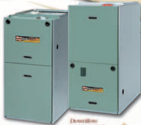
Upflow/Horizontal Model (UGHP)

Ruud ULTRA Series® Super Quiet 80® Two-Stage Gas Furnace with a GE® ECM® Motor