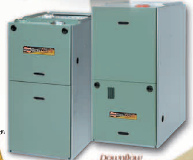
Upflow/Horizontal Model (UGHP)

Cool and calm at the center of any storm, completely at home in your environment.