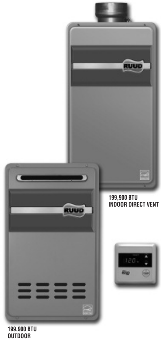
199,900 BTU INDOOR DIRECT VENT

See Commercial Warranty Brochure for details.