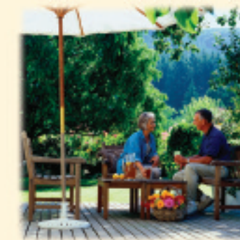
Renovations, Additions and Vacation Homes