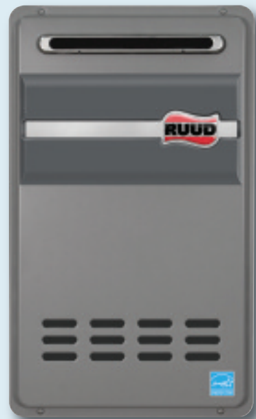
199,900 BTU OUTDOOR