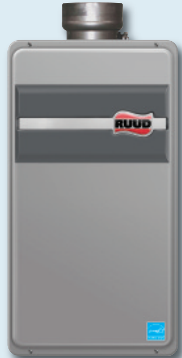
199,900 BTU INDOOR DIRECT VENT

With Ruud's new conversion kit, our 95 tankless series can now be converted to COMMERCIAL!