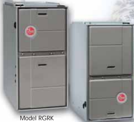
Model RGRK Upflow