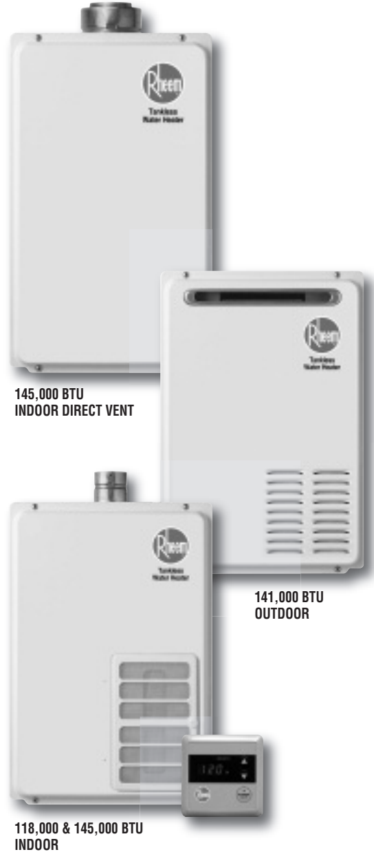
145,000 BTU INDOOR DIRECT VENT