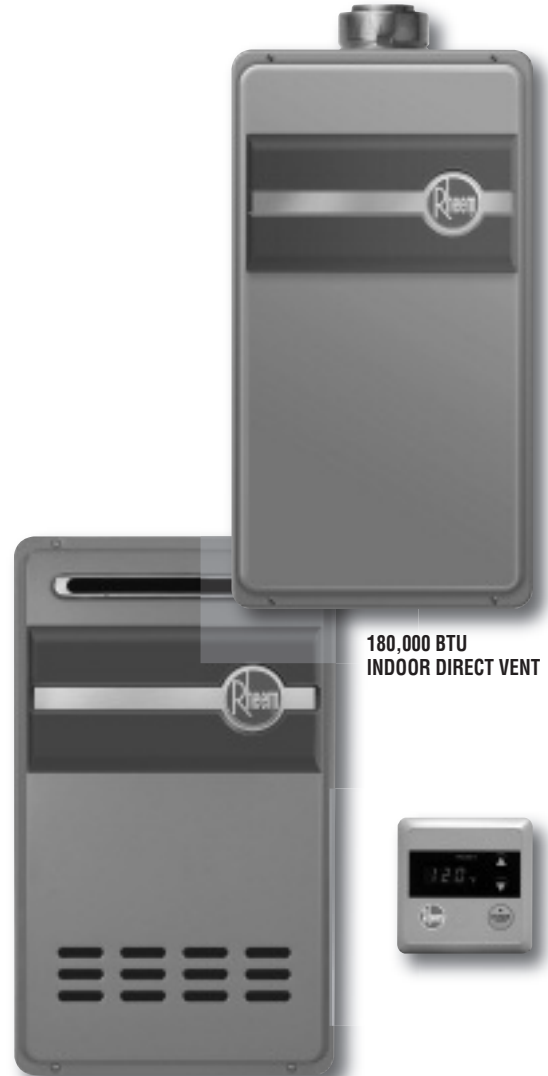
180,000 BTU INDOOR DIRECT VENT

With Rheem's new conversion kit, our 66 tankless series can now be converted to COMMERCIAL!