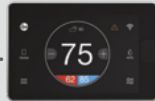
EcoNet Smart Thermostat