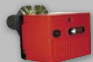
Optional Riello Burner

Beckett hi-speed flame retention burners are standard on Thermo Pride furnaces. They provide more complete combustion and higher fuel efficiency. Riello burners are also an available option.