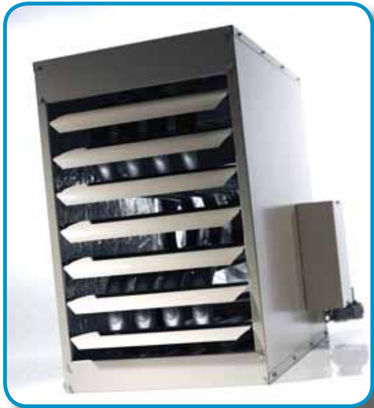
SEP unit heaters