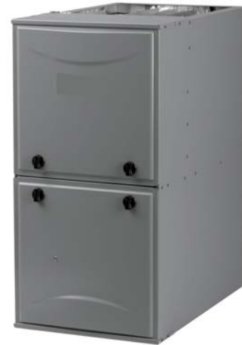
Illustrations and photographs are only representative. Some product models may vary.