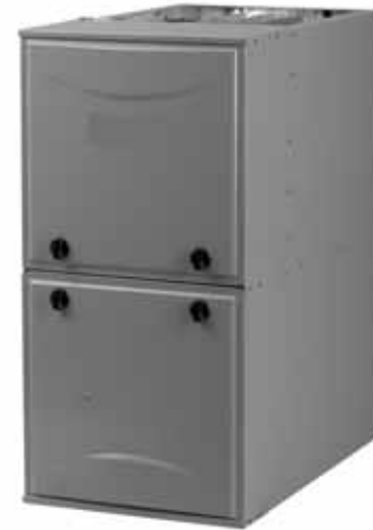
Illustrations and photographs are only representative. Some product models may vary.

* For owner occupied, residential applications only. See warranty certificate for complete details and restrictions, including warranty coverage for other applications.