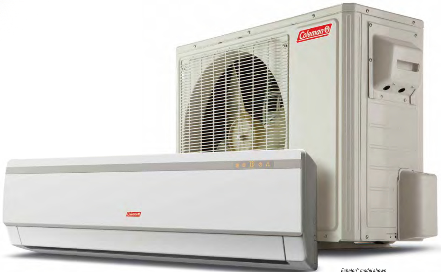
Echelon™ model shown